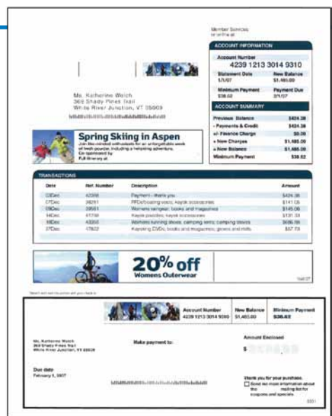
IMAGED FINANCIAL STATEMENTS